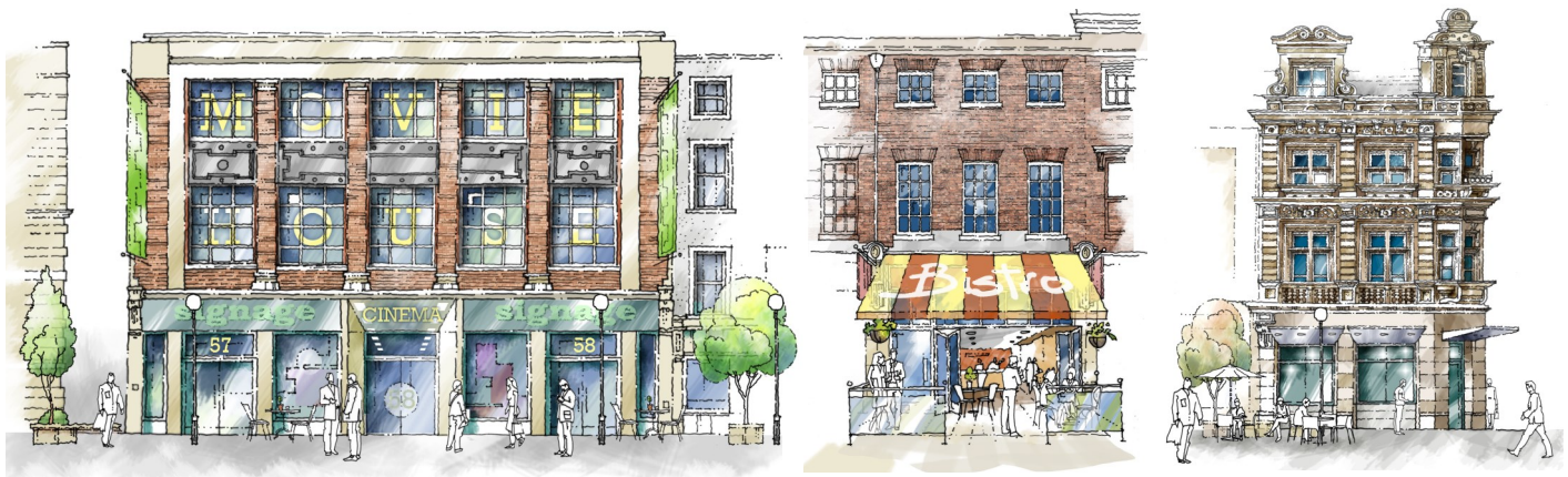
Concept designs for frontage improvements to buildings

Grants will cover up to 50% of the total project costs, helping to overcome barriers which have prevented private sector investment in the street. The scheme will unlock the full potential of Whitefriargate, encouraging new leisure, boutique retail and food & beverage uses that will ensure that the street remains sustainable over the long term.