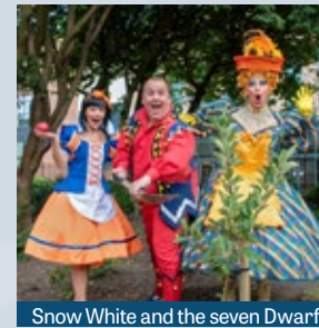
Snow White and the seven Dwarfs

Tower Tours Hull Minster Price - ticketed