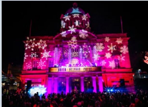
Christmas Light Switch On

In Conversation as Collective Strategy Humber Street Gallery Price – free