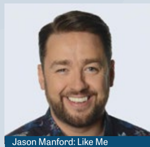
Jason Manford: Like Me

Culture: Music Christmas Concert Hull Minster Price - ticketed